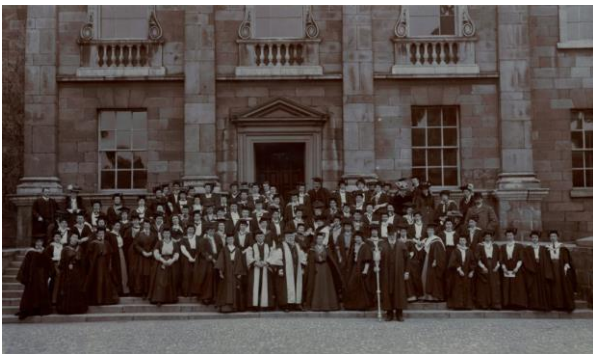
Former students of Girton and Newnham collecting degrees at Trinity College Dublin, circa 1904-1906