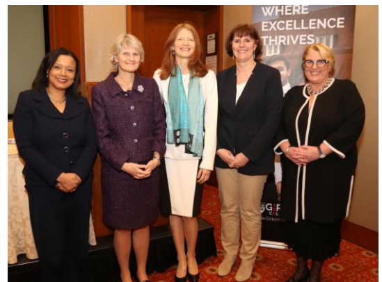
The Mistress with the Heads of Mount Holyoke, Bryn Mawr, Vassar and the Radcliffe Institute for Advanced Study discussing the future of the Colleges founded for women in New York, December 2018