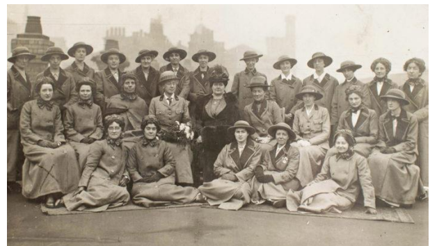
Girton and Newnham Unit of the Scottish Women's Hospitals about to embark on board ship at Liverpool, October 1915 - reproduced courtesy of the Royal College of Physicians and Surgeons of Glasgow.

https://creativecommons.org/licenses/by-nc-sa/3.0/